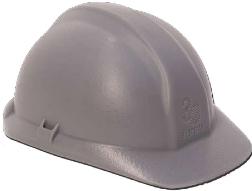
Functional prototype helmet used for durability testing

Get extreme performance and durability with Accura ® Xtreme Plastic.